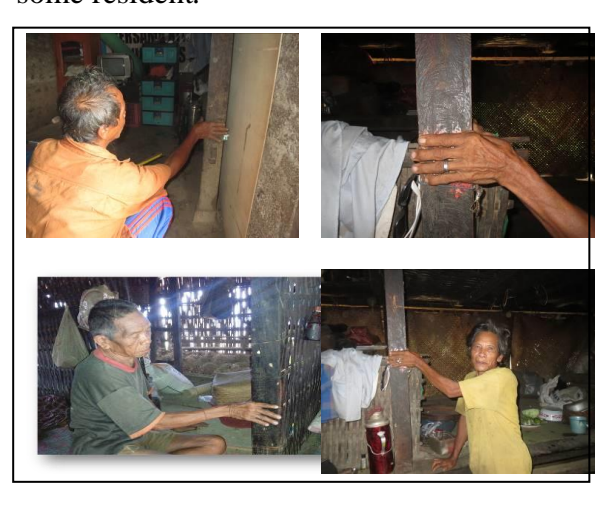
Figure 7. The width of the saka is equal to the length of the index finger

In theory, a rai is the length from the tip to the base of the index finger. Moreover, referring to the written text, measuring the bone segment on the outside of the index finger obtain the size of a rai. According to our observation, there is little difference between theory and application in society. From the interview with some elders of Bali Mula, there is an information that a rai is the distance from the tip of the index finger to the curve of the skin on the inside of the palm. The information from the community is in line with the fact that the width of Saka from Saka Roras' house is exactly the same as the length of the inside of index finger some resident.